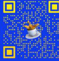
scan to know more about me!

I sprinkle a dash of creativity into everything. With a palette of skills at my disposal, I keep pushing the boundaries of what's possible!